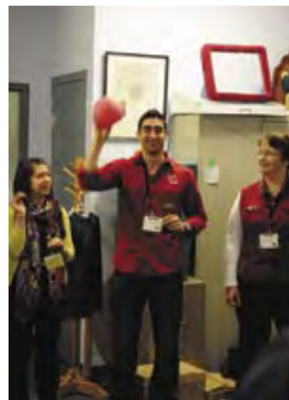
B.C. 4-H Annual Report 2010