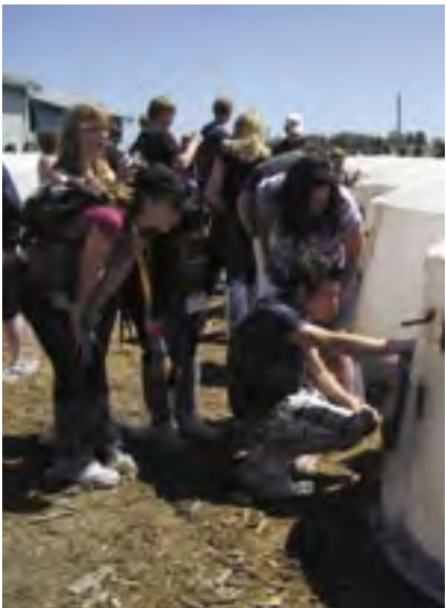
B.C. 4-H Annual Report 2010